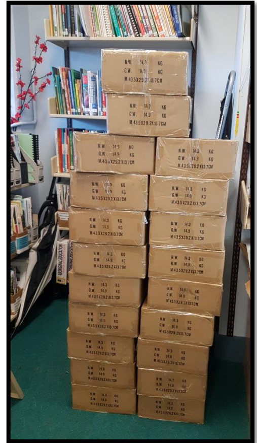
Maths books for covering