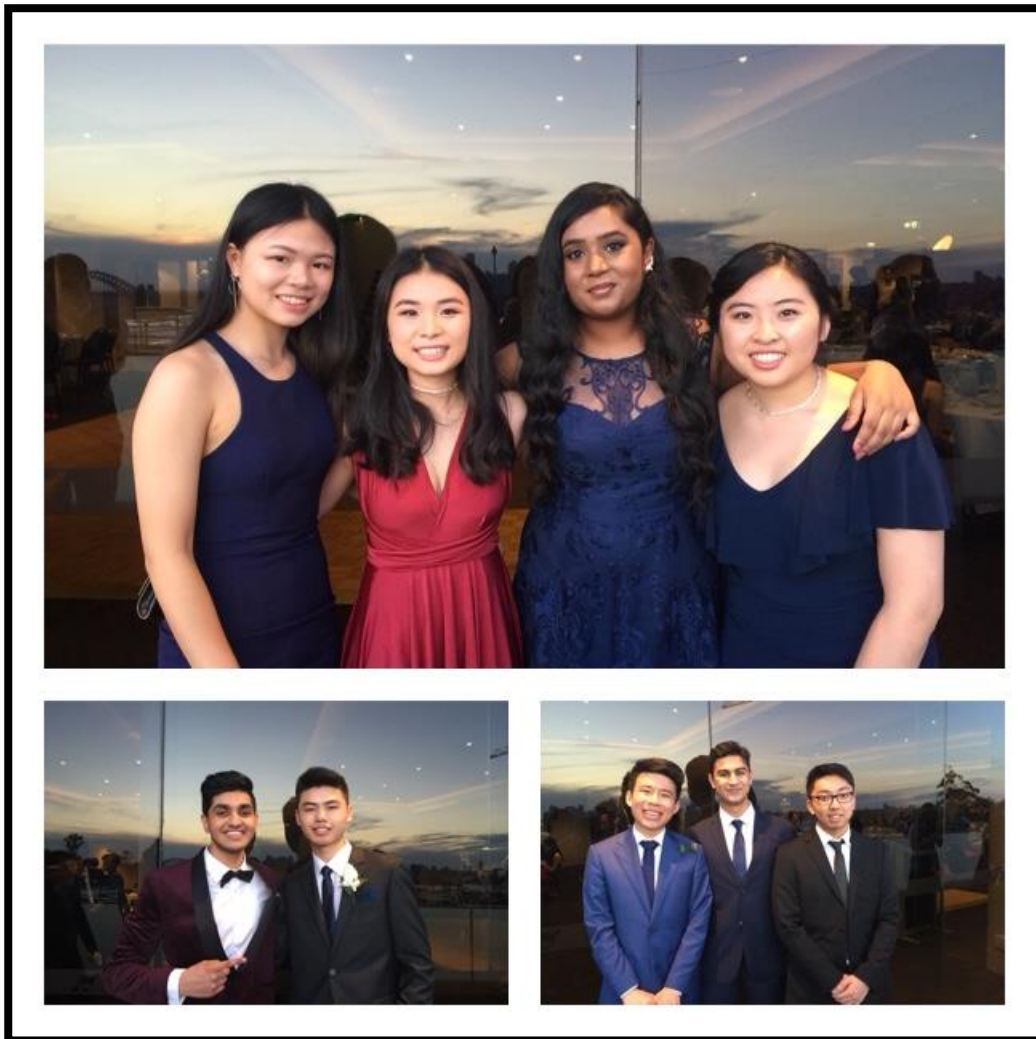
A few photos from the formal night